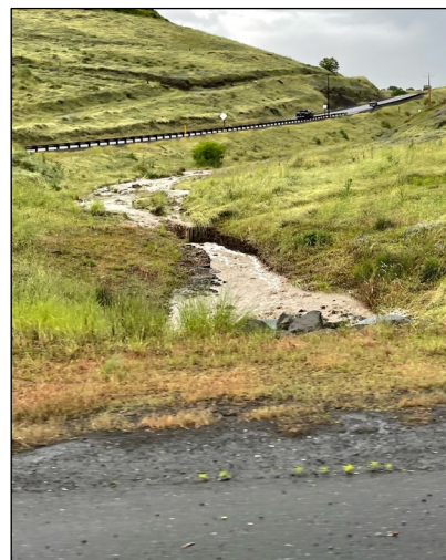
Critchfield Road, 6/5/22