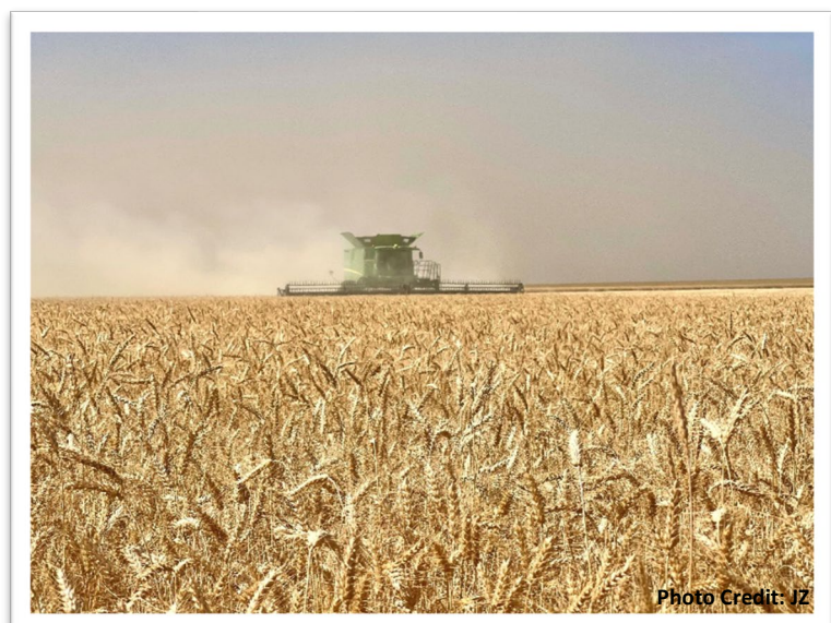
Combines are BUSY!