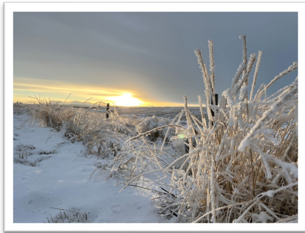
The land and the streams both benefit from snow.