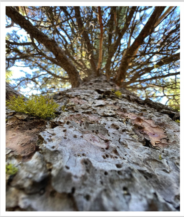
Large, healthy Ponderosa Pine in Asotin County

In 2021, 216.5 million turkeys were raised on turkey farms across the United States.