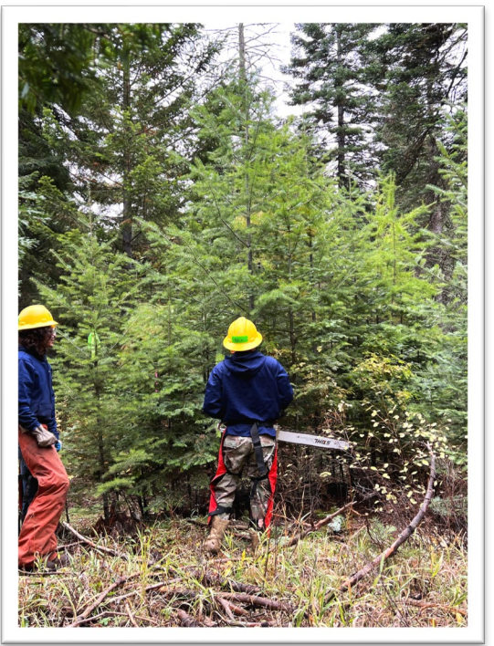
WCC Crew doing forestry work!