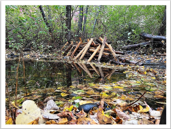
Instream Post Assisted Log Structures (PALS)