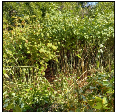
During residue removal