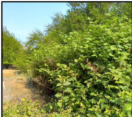
Japanese Knotweed in Asotin Co.

There is approximately less than one known acre of Japanese knotweed in Asotin County. The known populations are located in residential areas and are currently being treated. Japanese knotweed is a Class B listed noxious weed in Washington State and is eligible for the Early Detection, Rapid Response program (EDRR) in Asotin County. If you have seen this plant, please contact Kodie Wight at (509) 552-8119.