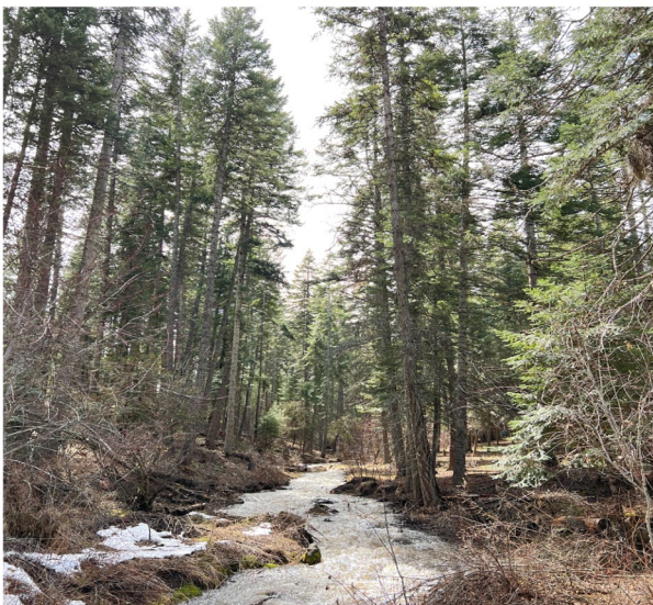
Healthy forest in the Blue Mountains of Asotin County

Asotin County, Washington set its snowfall record 47 years ago. On Feb 16, 1976, the county received 21 inches of snow over 24 hours.