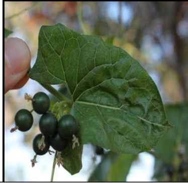
White bryony leaves with immature berries