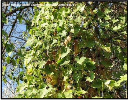
White bryony growing on a living tree.