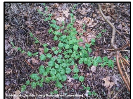
White bryony rosette