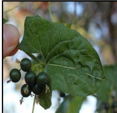
White bryony leaves with immature berries