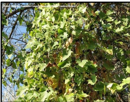
White bryony growing on a living tree.

A few individual populations have been documented in Asotin County and are currently being treated. If you have seen this plant, please contact Kodie Wight at (509) 552-8119.