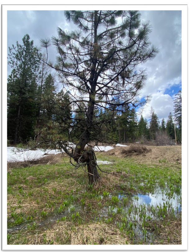
Nature has its own unique characteristics.