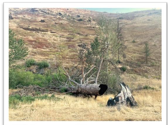
Large, downed Ponderosa Pine on Lick Creek from 2021 fire