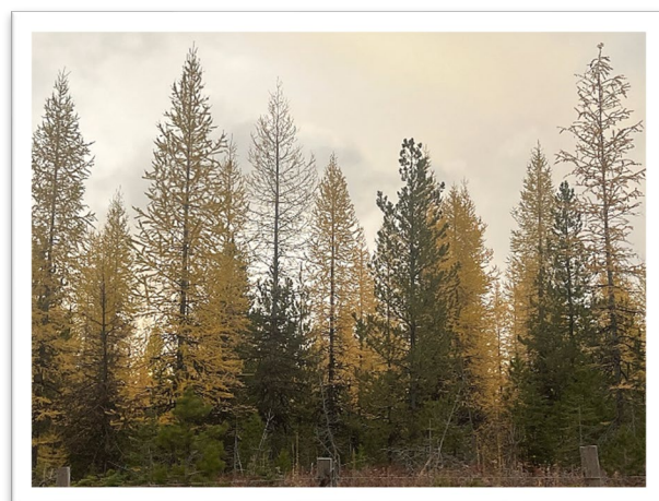
Tamarack (Western Larch) showing their fall color