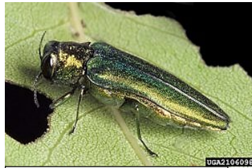
Emerald Ash Borer