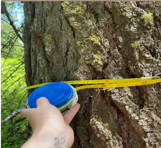
Measuring the circumference

( https://pubs.extension.wsu.edu/environmental-injury-frost-cracks-home-garden-series )